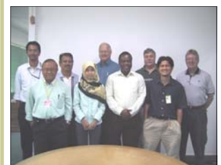
2005 Temana Team